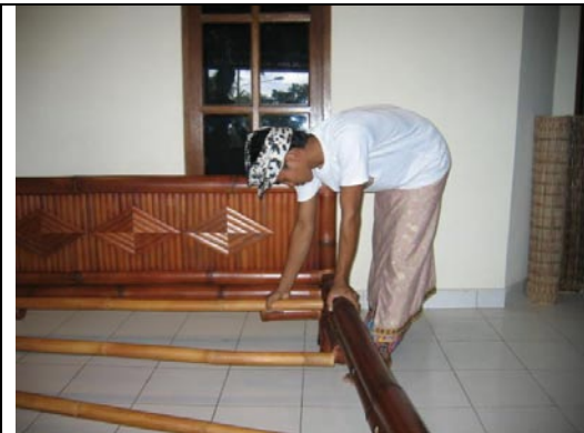
Begin putting the support posts into the right side rail. Do not attach the right side of the headboard to the right side rail.

Telephone: (local) 62-81-337-256060 (USA toll free) 1-866-413-BALI Fax: 62-361-947990 Email: info@balibamboocreations.com