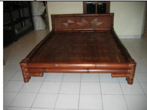
This shows the bed fully assembled.