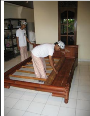
After the screws are in, unroll the split bamboo support mat from one side to the other.