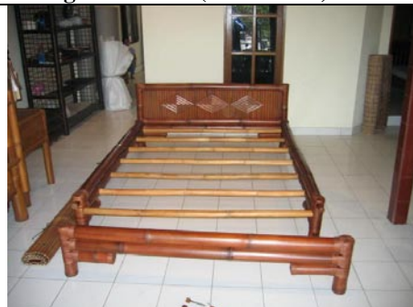
Continue putting the bamboo posts into the right headboard.