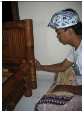
After putting in the first three bamboo support posts on the right side, attach, by pushing the right side of the headboard into the right side rail. (Labeled #2)