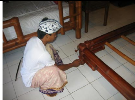
Use the small screwdriver to screw in each bamboo screw. There are two small openings in each corner for the screws. (8 in all). It is recommended that after there are all in, you should tighten them one more time.