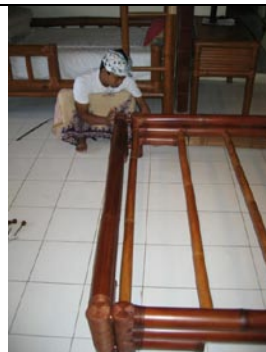
Finally, assemble together the bottom left side rail to the footboard (Labeled #4)