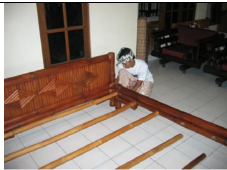
This shows the bed with the first three bamboo support posts inserted into the right side rail, and the right side rail attached with the headboard.