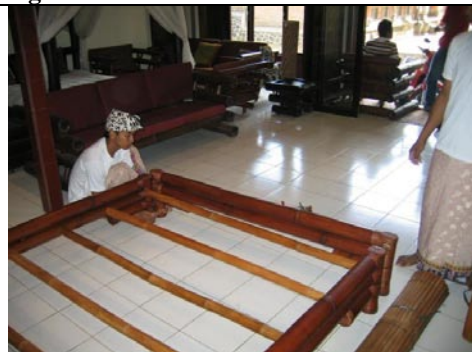
After pushing in all the bamboo support posts, assemble together bottom right side rail to the footboard (Labeled #3).